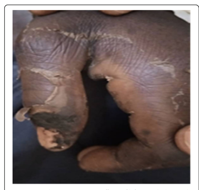
Fig. 3 Image showing pronation stiffness of left upper limb at snake bite point, in a 30-year-old woman presenting with motor deficit, speech disorder, and consciousness disorder