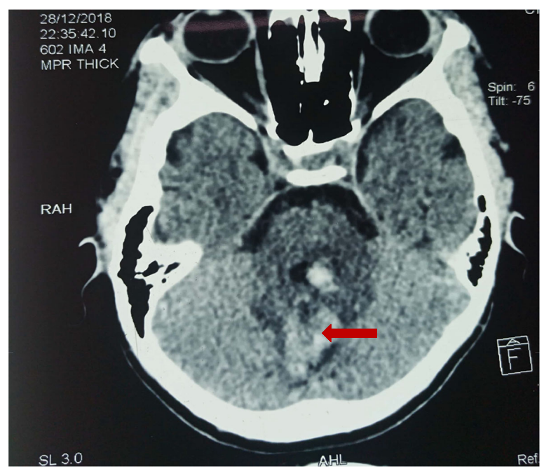
Fig. 2 Cerebral CT showing spontaneous left cerebellar hemorrhage, in a 16-year-old male presenting with loss of consciousness and severe anemia following snake bite