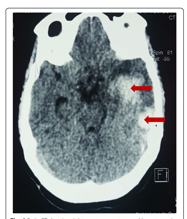
Fig. 4 Brain CT showing right spontaneous temporal hematoma, in a 30-year-old woman presenting with motor deficit, speech disorder, and consciousness disorder